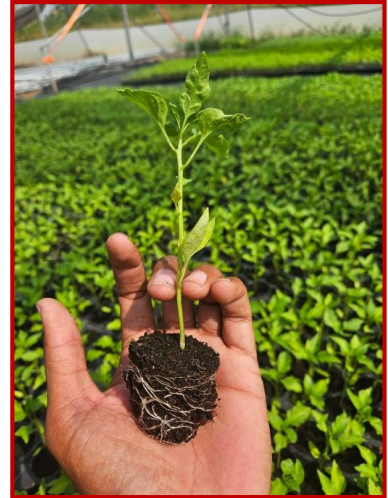
Nursery unit under ARYA project