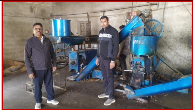
Mini Oil Mill Enterprise at Targhadi village