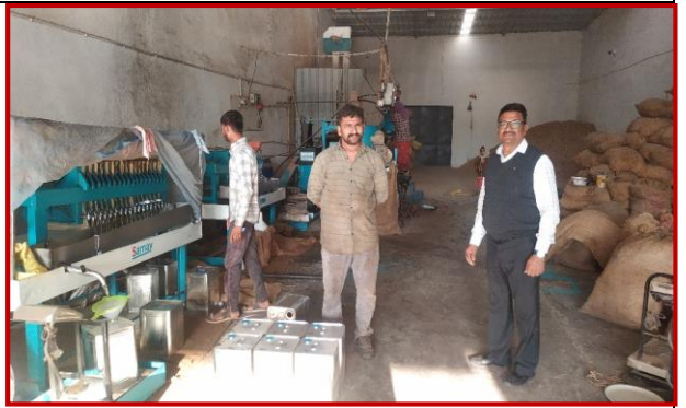
Mini Oil Mill Enterprise at Kuvadava village